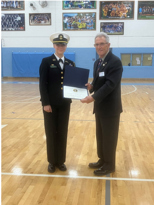
Continuing from the previous pages are members presenting Leadership awards to local High School students.